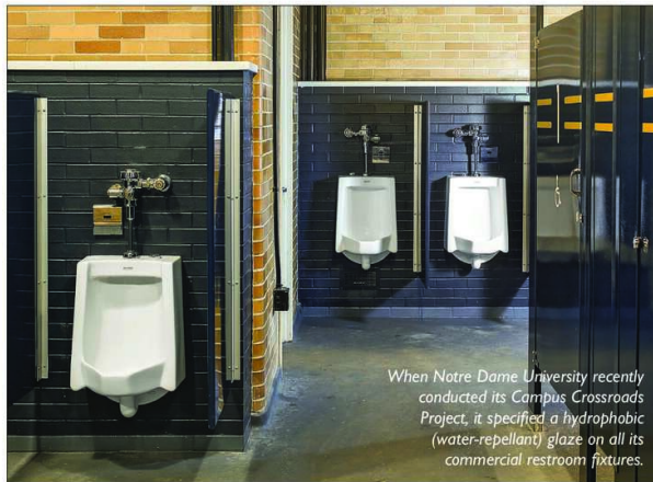
When Notre Dame University recently conducted its Campus Crossroads Project, it specified a hydrophobic (water-repellant) glaze on all its commercial restroom fixtures.

know the fixtures they're using — automatic or manual — are as clean as possible. That's why manufacturers have developed a glaze to impart hydrophobic (water-repellant) and oleophobic (oil-repellant) properties to vitreous china. These glazes repel liquid and inhibit the growth of germs and bacteria to help maintenance teams by making the fixture easier to clean and keeping it cleaner longer.