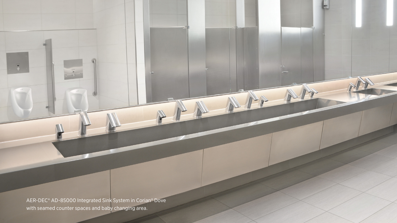
AER-DEC® AD-85000 Integrated Sink System in Corian® Dove with seamed counter spaces and baby changing area.